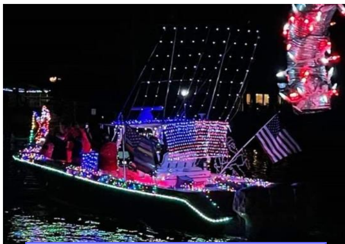
1st Place: #3 Raining America Les & Ellie Weiss & Crew

A beautiful night it was on December 19th and our 10 Boats put on a show for throngs of folks lining the shore!! The enthusiasm and light displays along the route were better than ever! Thanks to all our captains and crews, those who cheered from the shore and those who voted. The top vote getters were: