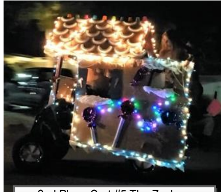
2nd Place Cart #5 The Zackers "Gingerbread House"