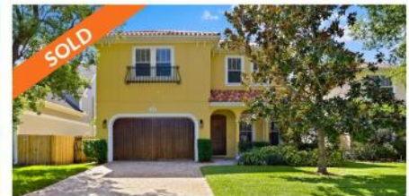
3913 S Kenwood Avenue | 4 Bed | 4 Bath | 3,423 SF Tampa | Last offered at $919,999