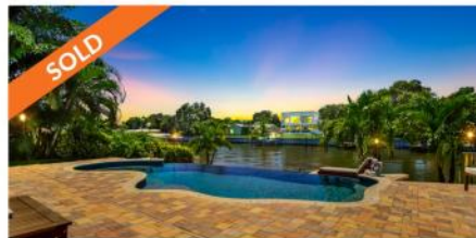
6693 28th Street S | 4 Bed | 2 Bath | 2,651 SF Pinellas Point | Last offered at $875,000