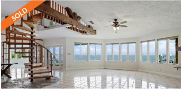
4535 45th Street S | 4 Bed | 3/1 Bath | 4,151 SF Last offered at $1,189,000