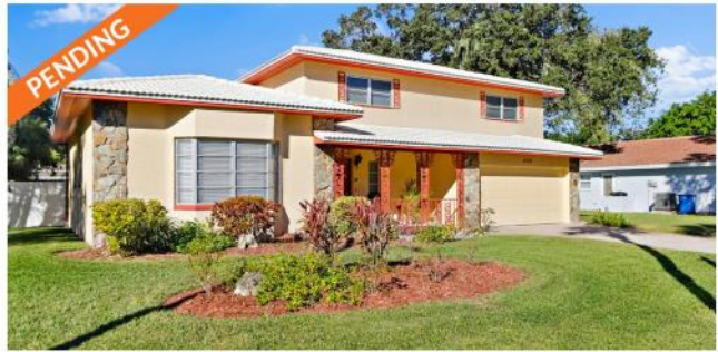
4097 40th Street S | 4 Bed | 3 Bath | 2,716 SF Last offered at $499,900