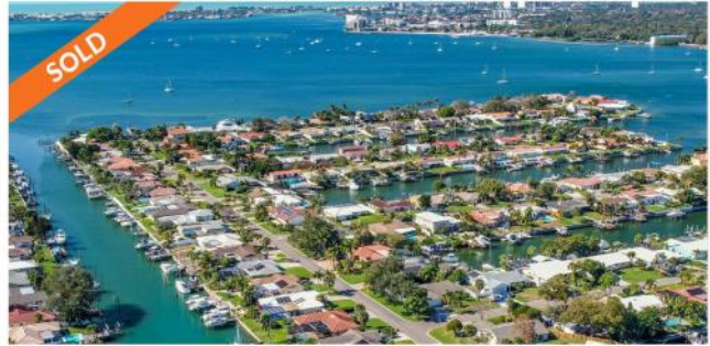
4425 45th Street S | 4 Bed | 2/1 Bath | 2,224 SF Last offered at $1,050,000