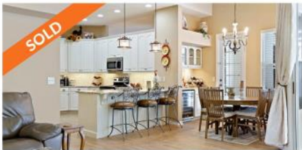
4802 Queen Palm Terrace NE | 4 Bed | 3 Bath | 2,484 SF Placido Bayou | Offered at $739,900